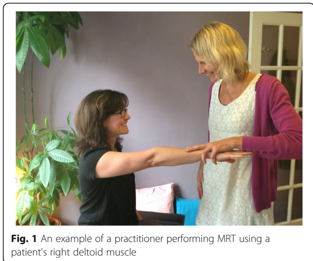
Fig. 1 An example of a practitioner performing MRT using a patient’s right deltoid muscle

TPs spoke 40 statements of mixed verity as follows. They viewed pictures on a computer screen placed out of view of the practitioners. While viewing a picture selected at random by computer, the TPs were given instructions by computerised voice via an earpiece inaudible to the practitioners. Instructions took the form, “Say, ‘I see a _____.’” The verity of the statements (that is, whether the instructed statement was chosen to match the picture on screen) were randomly allocated by software (DirectRT Research Software,